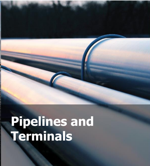
Pipelines and Terminals