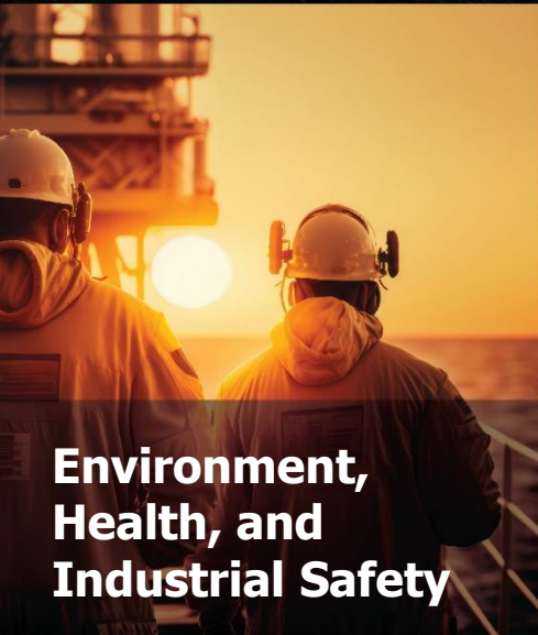
Environment, Health, and Industrial Safety