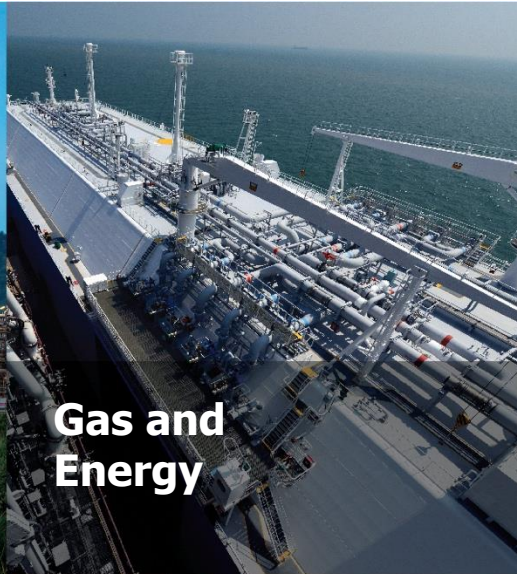
Gas and Energy