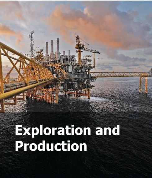
Exploration and Production