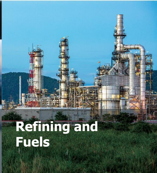
Refining and Fuels