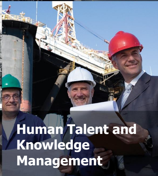
Human Talent and Knowledge Management