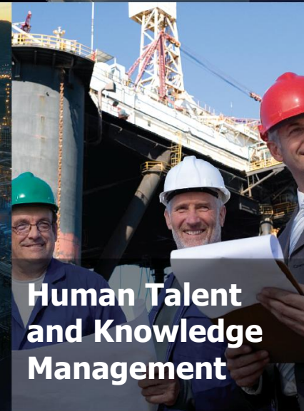
Human Talent and Knowledge Management