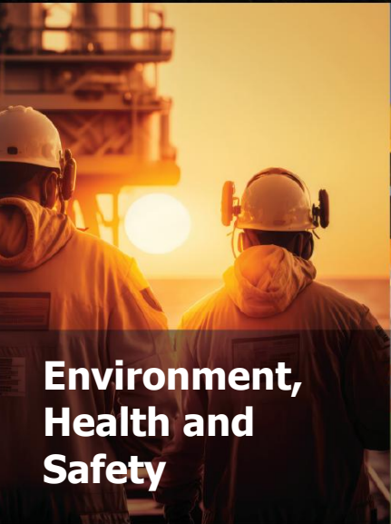
Environment, Health and Safety