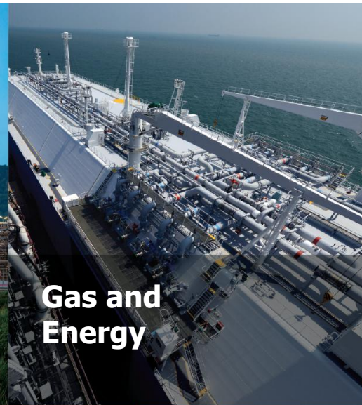
Gas and Energy